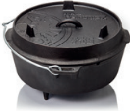
Dutch Oven ft1-ft18

Petromax offers many more products suitable to your Dutch Oven Table: