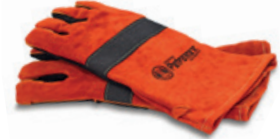
Aramid Pro 300 Gloves